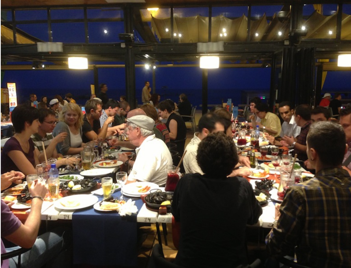
EULERSS'13 @ UPC Barcelona, July 1-5 2013