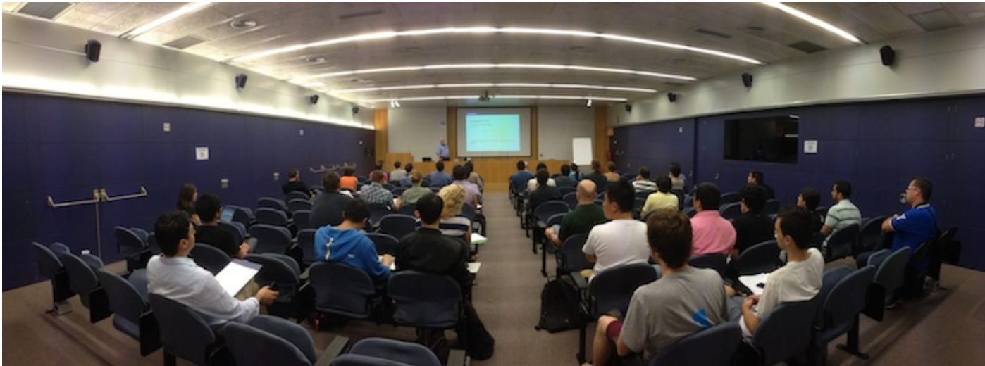
EULERSS'13 @ UPC Barcelona, July 1-5 2013