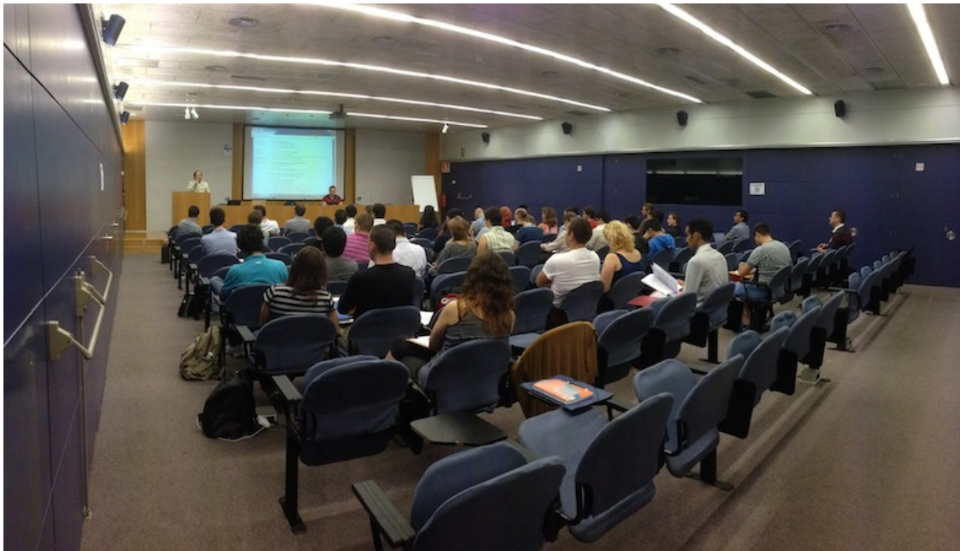
EULERSS'13 @ UPC Barcelona, July 1-5 2013

EULER Summer School 2013 at UPC, Barcelona, Spain, July 1-5 2013