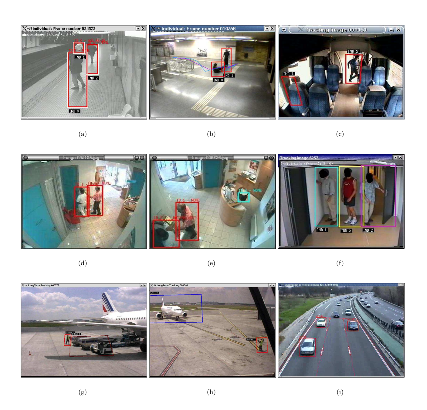
Fig. 1. This figure shows six Activity Monitoring Systems (AMS) derived from VSIP to handle different applications. Image 1(a) illustrates a metro monitoring application system running on black and white cameras of the YZER station in Brussels. Image 1(b) illustrates the same system but analyzing images from a color surveillance camera of the SAGRADA FAMILIA station in Barcelona. Image 1(c) illustrates a system for unruly behaviors detection inside trains. Images 1(d) and 1(e), taken with 2 synchronized cameras with overlapping field of view working in a cooperative way, illustrate a bank agency monitoring system detecting an abnormal "bank attack" scenario. Image 1(f) illustrates a single-camera system for a lock chamber access control application for building entrances. Images 1(g) and 1(h) illustrate an application for aprons monitoring on airports; this application combines a total of 8 surveillance cameras with overlapped fields of view. Finally, image 1(i) illustrates an highway traffic monitoring application.