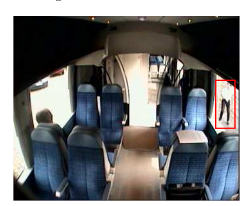
Fig. 6. This image shows a person (on the right) who is seen through a window in the wall. In this case the repositioning algorithm has to take into account the particular situation and to avoid repositioning the person inside the train when it is outside.

For example, the repositioning algorithms (developed for the bank agency monitoring system) was designed to correct the position of individuals when they are wrongly detected behind a wall (in situations where legs are not detected). The algorithm gives incorrect results in train surveillance system because it wrongly correct the position of people who are behind walls containing a window (see figure 6). Thus two algorithms have to be developed to handle scenes containing both walls with or without windows.