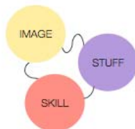
Figure 1 Simplification of interrelated elements of practice

The pilot study consisted of two main parts. Part one was a homework assignment where participants were asked to describe their bathing practices and come up with and execute ‘experiments’; they were asked to think of different ways of bathing that would reduce resource consumption and still be acceptable or even preferred as daily routines. A period of two weeks was taken with regard to the long term character of developing and establishing new routines. Individual workbooks with assignments and reflective questions guided the participants in the process. An important function of the workbook was to stimulate participants to think about bathing and its resource consumption on a practice level. To explain the elements steering the practice and their relations, the simplified terms image, skill and stuff were used and represented graphically (see Figure 1). Participants were asked to describe their current practice and changes therein according to these elements. To stimulate exchange of ideas, participants were asked to interact on an online blog during the second week of experiments.