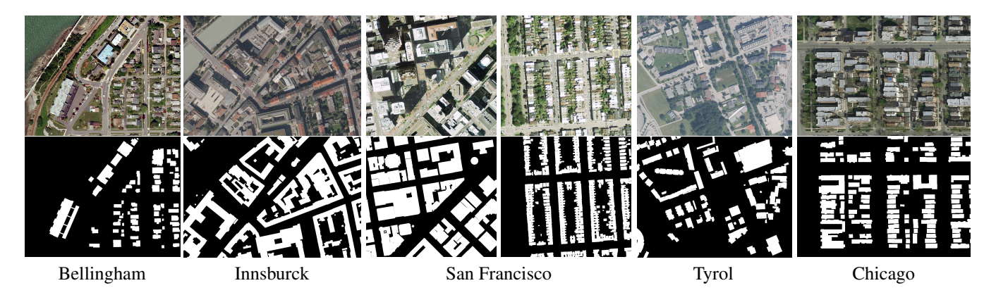
Fig. 2: Close-ups of the dataset images and their corresponding reference data.

and low-density (e.g., Kistap/Bloomington, West/East Tyrol) urban settlements. While aerial images over Tyrol are present in both subsets, they have been obtained at different flights over the country, thus showing different illumination characteristics. We have also selected dissimilar images inside some of the groups (e.g., Kitsap County contains tiles from two different flights with very dissimilar characteristics). The reference data was created by rasterizing the shapefiles with GDAL. Fig. 2 shows closeups of the images in the dataset.