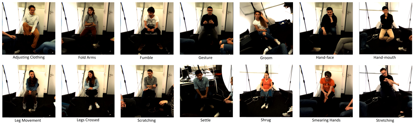
Figure 1: Examples of annotated bodily behaviors.