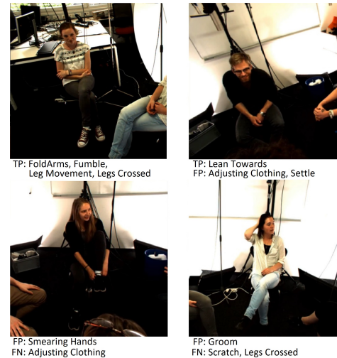
Figure 4: Illustrative examples of true positive, false positive and false negative predictions.

In addition to MAP, the evaluation metrics are calculated from the detection confidence vector on the frame level: True Positives (TP) as the sum of confidences in true classes, False Positives (FP) as the sum of confidences in false classes, and False Negatives (FN) as the sum of 1 minus confidences in true classes. From TP, TN and FN on the frame level, we calculate the F1 score globally using both micro and macro averaging. As expected from behavior recognition, Swin achieves the best results with F1 0.728/0.544 and MAP 0.742/0.415