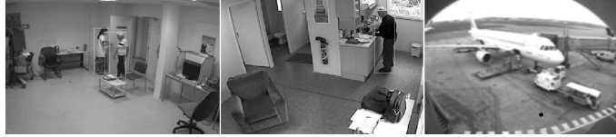
Fig. 2. Two health care and one airport activities monitoring applications.