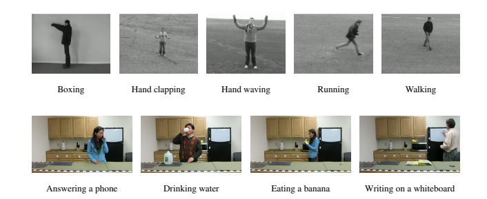
Figure 2: Sample frames from video sequences of the KTH (first row) and ADL (second row) datasets.

In order to quantize local features, we use the k-means clustering technique and nearest neighbour algorithm. To compute the bag-of-words representation, features are quantized to the codebook size of 1000, which has shown empirically to give good results. As a metric to calculate a distance between features and visual words, we use the L_2 norm. Since Harris3D corner detector calculates sparse spatio-temporal features, we set the weights w as w^{(x)}=1 , w^{(y)}=2 , w^{(t)}=4 (Equation 5). To compute STOCF features, the HOG-HOF descriptors are quantized to small codebook sizes (10, 15, 20 and 25) and