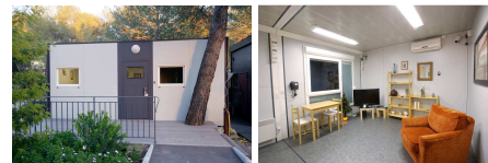
Figure 1 Gerhome laboratory pictures