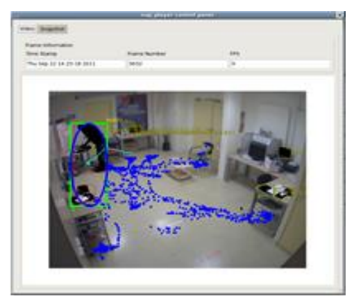
Figure 2. Multi-sensor activity recognition system screen. Rectangle envelope highlights the detection of a person in the scene. Blue dots represent previous positions of the detected person in the scene.

The vision component has been developed using a modular vision platform locally developed that allows the test of different algorithms for each step of the computer vision chain (e.g., video acquisition, image segmentation, physical objects detection, physical objects tracking, actor identification, and actor events detection). The vision component extracts the objects to track from the current frame using an extension of the Gaussian Mixture Model algorithm for background subtraction [26]. People tracking is performed by a multi-feature tracking algorithm presented in [20], using the following features: 2D size, 3D displacement, color histogram, and dominant color. Fig. 2 shows an example of the vision component output. Rectangle envelope highlights the detection of a person in the scene. Blue dots represent previous positions of the detected person in the scene.