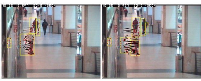
(a) Frame: 12.

In the second experiment we chose from this database a short video sequence with partial occlusion. This video sequence presents one person leaving the shop and two other going through the hall. The results are presented on the following figure 3. This figure show that some points are lost, some points are tracked incorrectly but most of the points are tracked correctly what let us to successfully track objects through partial occlusions.