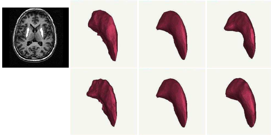
Fig. 2. First image: Transversal slice of a CT volume of the brain where the putamen structures are marked in white. First and second row: The mean shape (middle images) of the left putamen and the principal deformations according to the first eigenvector ( \mathbf{v}_1 ) and second eigenvector ( \mathbf{v}_2 ). The images show a deformation of -3\sqrt{\lambda_i}\mathbf{v}_i (left) and +3\sqrt{\lambda_i}\mathbf{v}_i (right) respectively (with \lambda_i being the associated eigenvalues).